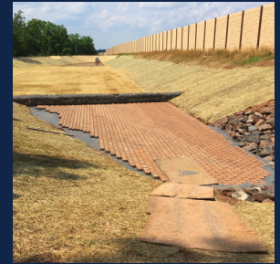
EROSION CONTROL: Soil Stabilization Products