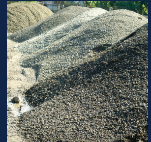
FINE & COURSE AGGREGATE: AASHTO Certified Stone