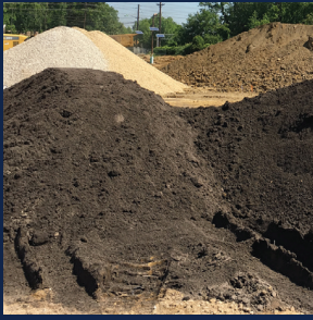
BLENDED SOILS: 100% Virgin Materials Soils Blended to Specification