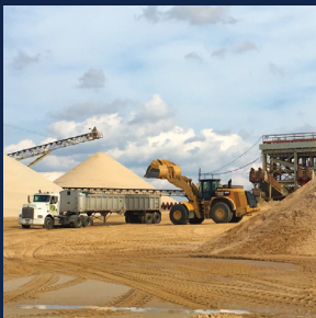
SANDS: Certified Clean