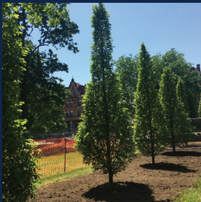
PROJECTS: Environmental, Construction, Fields & More