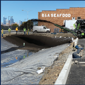
DOT APPROVED SUPPLIER: DOT, Army Corp, More