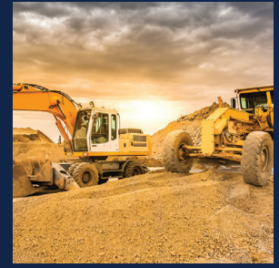
SITE SPECIFICATIONS: Meets IGW Remediation Standards

Certified DBE, SBE, and WBE Trucking/Hauling Services, Bulk Materials, Construction Materials, Recycled Materials