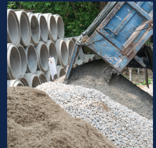
UNDERGROUND SYSTEM SUPPLIES: Water, Sewer & Utility Systems