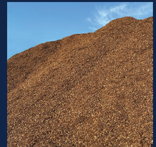
NATURAL WOOD MATERIALS: Organic Root, Pine Bark, & Leaf Mulch