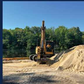
EQUIPMENT RENTALS: On-Site