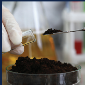
SOIL TESTING & SPECIFICATIONS: Approved Soil Specialist & Supplier